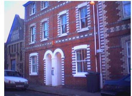
Off Greyfriars Road, first turning left

“Letting out my feelings in privacy—very helpful”